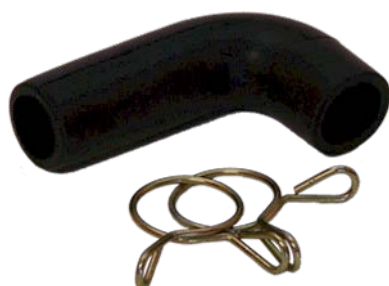
Hose and clips included

Hose bib for low pressure alarm connection. (Models: STA60N, 80N & STA100N)